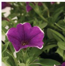
'Rhythm & Blues' petunia

The petunia is from Ball Horticultural Co., grows vigorously and will fill out garden beds, decorative containers or hanging baskets in no time. Hanging baskets and containers are a great way to show off the attributes of this exceptional garden plant.