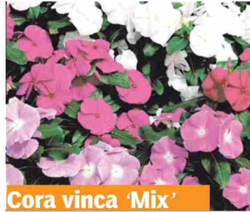
Cora vinca 'Mix'